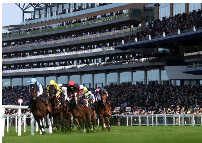
Runners and riders in the Ascot Stakes during day one of Royal Ascot