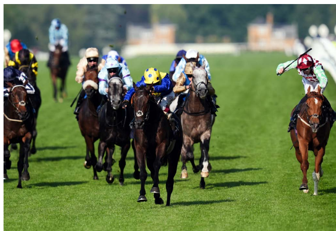
Never So Brave ridden by Oisin Murphy on their way to winning the Buckingham Palace Stakes on day three of Royal Ascot 2025