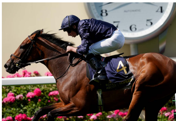
Garden Of Eden ridden by Ryan Moore winning the Ribblesdale Stakes on day three of Royal Ascot 2025