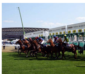
Runners and riders break from the stalls during the Ribblesdale Stakes 2025